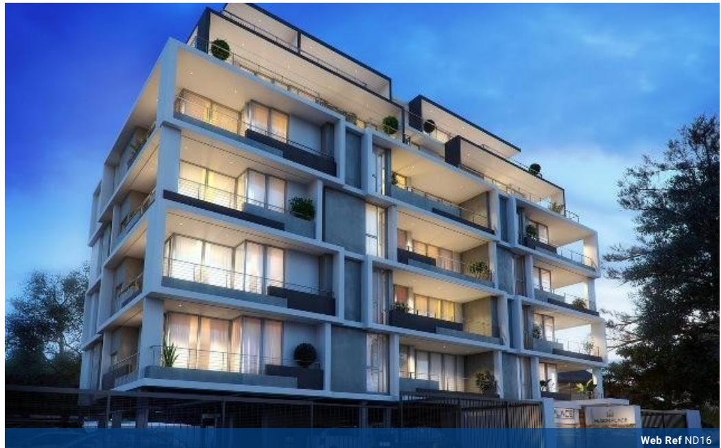
Web Ref ND16

Werkhuis, 1st Floor Kildare Centre Cnr Kildare Road & Main Street Newlands, Cape Town 7700