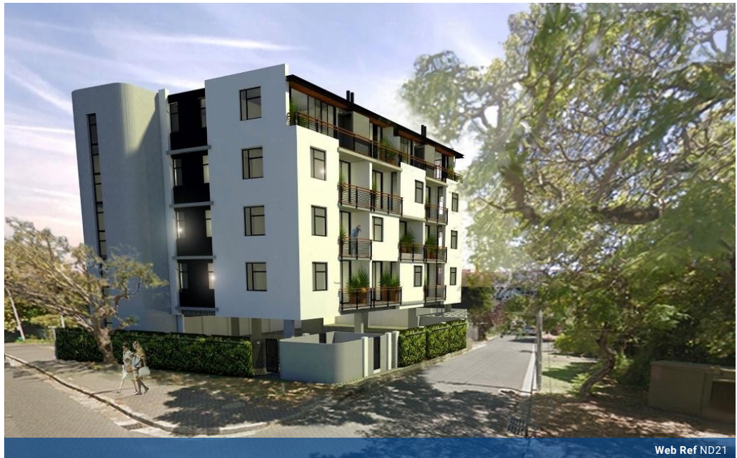
Web Ref ND21

Werkhuis, 1st Floor Kildare Centre Cnr Kildare Road & Main Street Newlands, Cape Town 7700